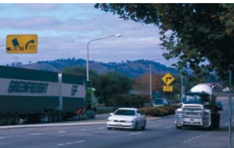
'Rollover corner' in Albury will be bypassed

A second crossing of the Murray River between Albury and Wodonga will be created, along with a 3.7km road link to Bandiana, connecting the Murray Valley Highway, south-east of Wodonga with the Hume Freeway.