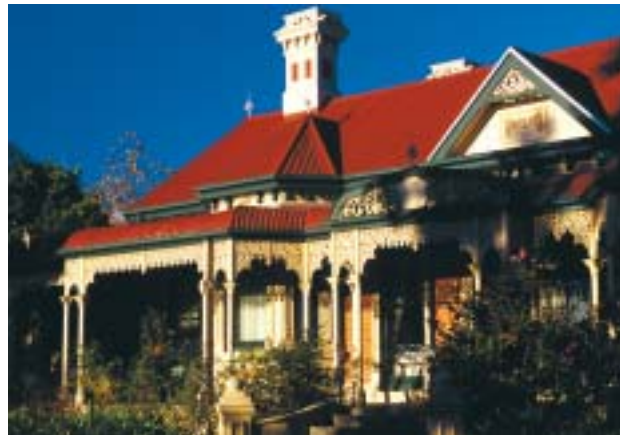
Cambourne House in Wodonga will be preserved

The freeway route has been adjusted in order to preserve the heritage-listed Cambourne House in Wodonga.