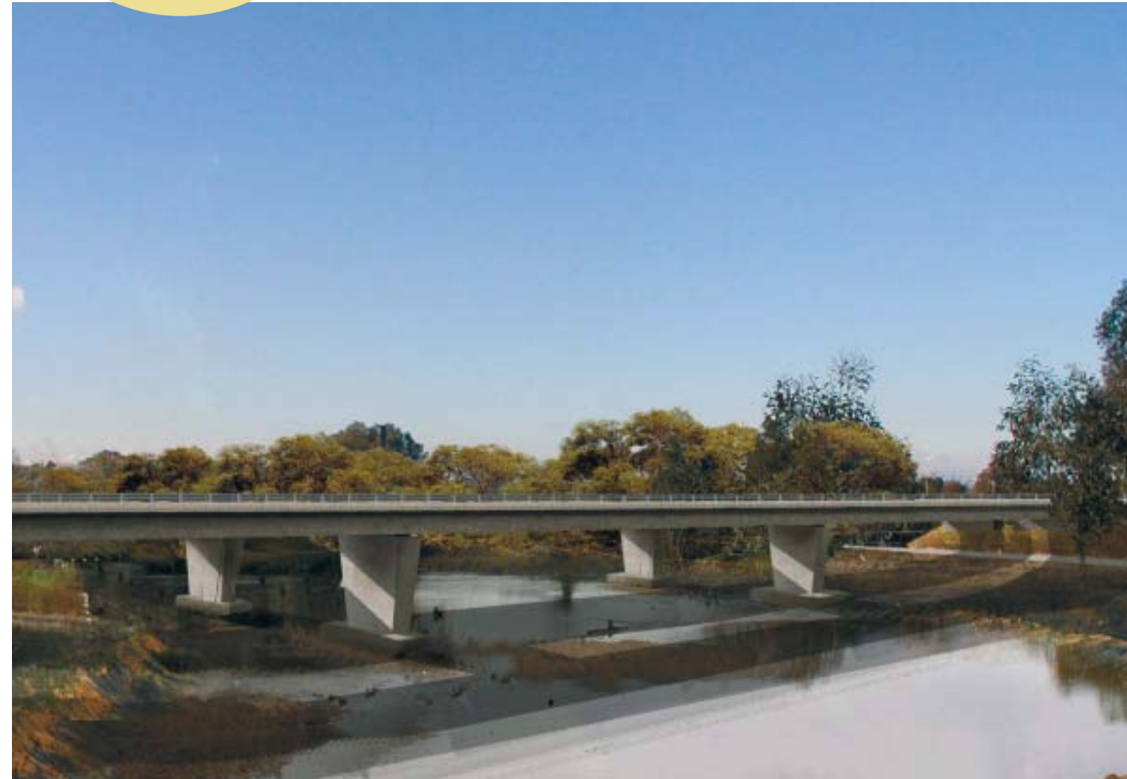
Front Cover: Artist impression of new bridges over Murray River